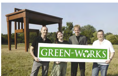
Green-Works overseas project

Green-Works Premier Membership Annual Fee is £12,000